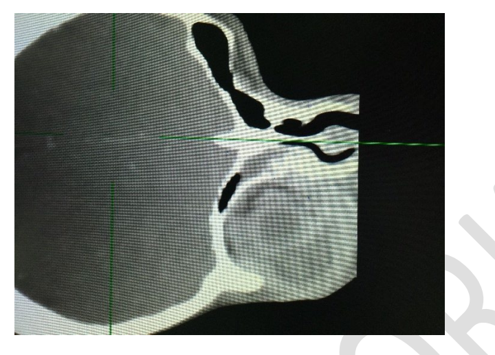
Figure 3: CT scan image showing complete opacification of the right maxillary, anterior and posterior ethmoid paranasal sinuses